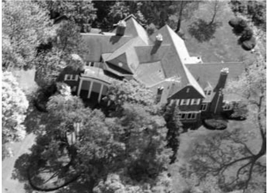
Aerial view of the Rockledge property in Perrysburg

To learn more about giving a gift of real estate, please contact Bridget Brell Holt, donor relations officer, at 419.241.5049 or Bridget@toledocf.org .