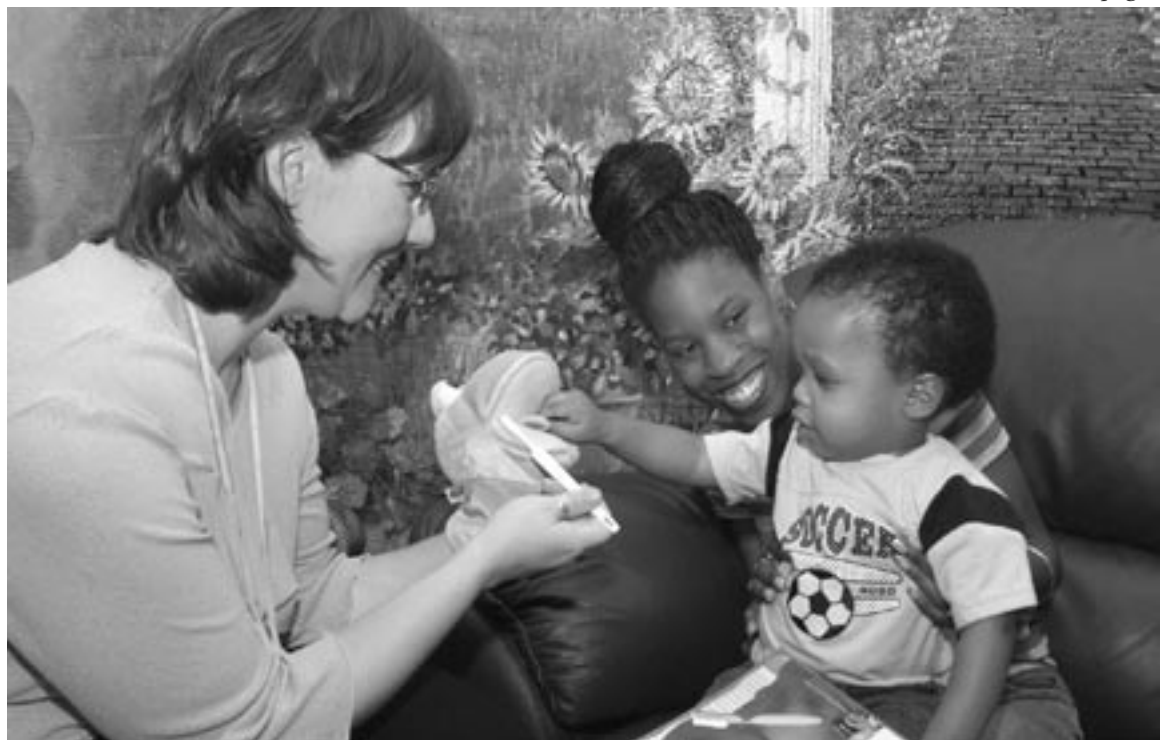
An outreach worker explains the importance of brushing teeth.

All staff can be reached at 419.241.5049 or visit our website at www.toledocf.org .