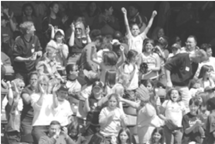
Kids enjoy Mud Hens games through the Helping Hens Fund.